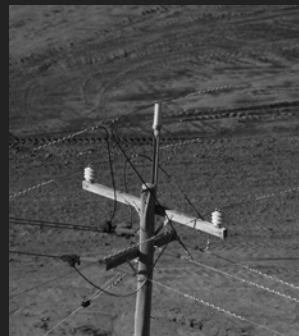
PANORAMA 360° IMAGERY